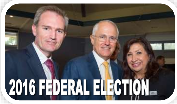
2016 FEDERAL ELECTION

The Government will spend a further $136 million on the My Aged Care contact centre to meet increasing demand from consumers trying to navigate the system. This is assuming that the current ageing population is so computer tech savvy, that there is going to be this extreme influx of people wanting to use the system. As it stands currently the system is not working to what it was promised to do. Older people are still none the wiser as to their rights or what they are entitled to.